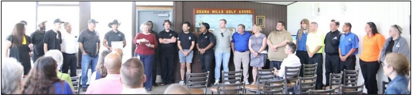
#TeamCity Community Team Award – Metro Operations Division (8/8/2025)