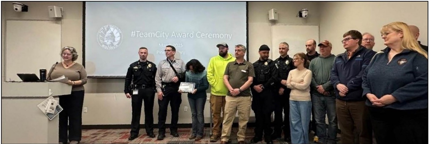
#TeamCity Dignitary Protection Team – Cross departmental team including Traffic Engineering, Parking & Metro Transit (5/7/2025)